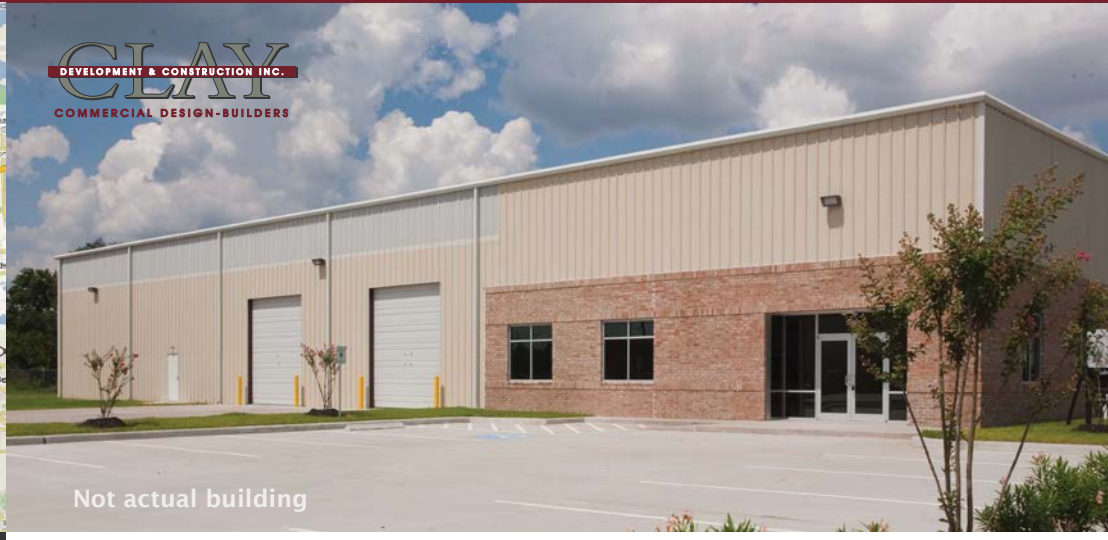
Not actual building